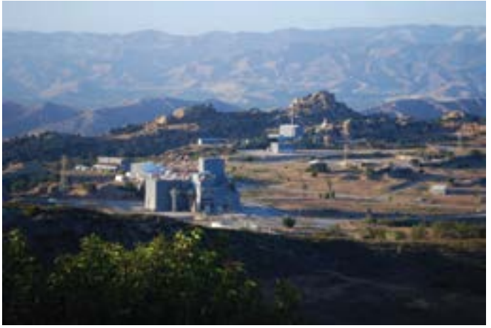
Santa Susana Area IV.

ON DECEMBER 6, 2010, THE state and federal governments signed legally binding agreements assuring that all the contamination that could be detected at Santa Susana Field Laboratory (SSFL) would be cleaned up. After 36 years of effort by the community, elected officials, and assistance from Bridge the Gap, it seemed there was cause to rejoice. Half a century after a nuclear reactor there experienced a partial meltdown, there was finally a commitment to clean up all the radioactive and chemical pollution at the site. Radioactive and toxic wastes had been burned in open pits. Thousands of tests of missile and rocket engines were conducted, with toxic chemicals released into the air and spilled onto the soil and